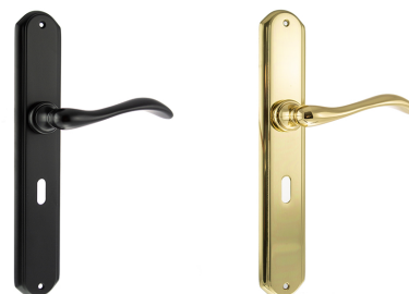
Product Finish Pictured: Matt Black & Polished Brass